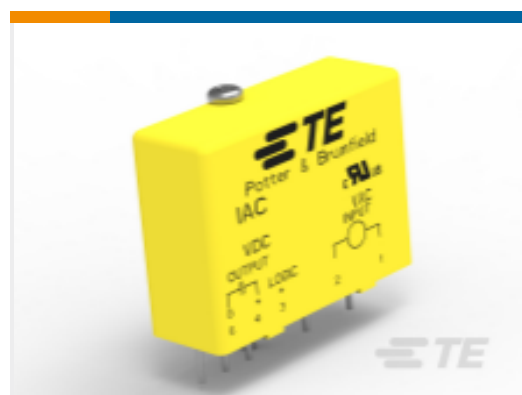
TE Part # CAT-P851-IA1 SSR PCB Mount, Slim Relays